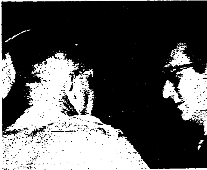
U.S. presidential adviser Henry Kissinger (left) is greeted in Saigon by Army Chief of Staff Creighton Abrams, former U.S. Commander in South Vietnam.